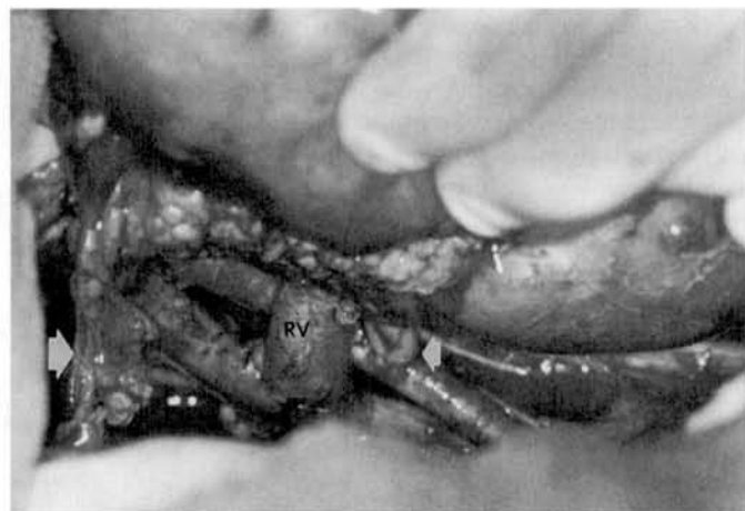
FIGURE 3. Adequate lengths of allograft ureter (large arrow), renal vein (RV), and renal artery (small arrow) were obtained. This is exhibited here with the kidney in situ after transplantation.

This case demonstrates that laparoscopic live-donor nephrectomy can be performed without detriment to either the donor or the recipient. By placing the incision in a low midline position, we believe we markedly decreased the morbidity usually associated with the traditional flank incision. Laparoscopic visualization affords excellent exposure to the kidney and the hilar structures. Video magnification facili-